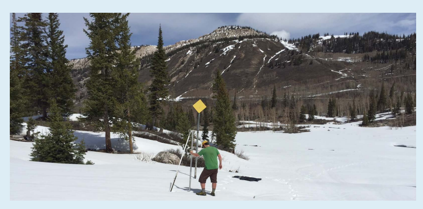
A surveyor measures the depth of the snowpack at Mt. Baldy on the Wasatch Plateau in April 2015. The map below shows the results of many years of this type of measurement.

Diminishing snowpack can shorten the season for skiing and other forms of winter tourism and recreation. The tree line may shift, as subalpine fir and other high-altitude trees become able to grow at higher elevations. A higher tree line would decrease the extent of alpine tundra ecosystems, which could threaten some species.