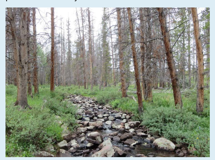
In Utah's Uinta-Wasatch-Cache National Forest, bark beetles have killed more than 90 percent of the trees in some areas.

Warmer and drier conditions make forests more susceptible to pests. Drought reduces the ability of trees to mount a defense against attacks from pests such as bark beetles, which infested 50,000 acres of Utah's forests in 2012. Temperature controls the life cycle and winter mortality rates of many pests. With higher winter temperatures, some pests can persist year-round, and new pests and diseases may become established.